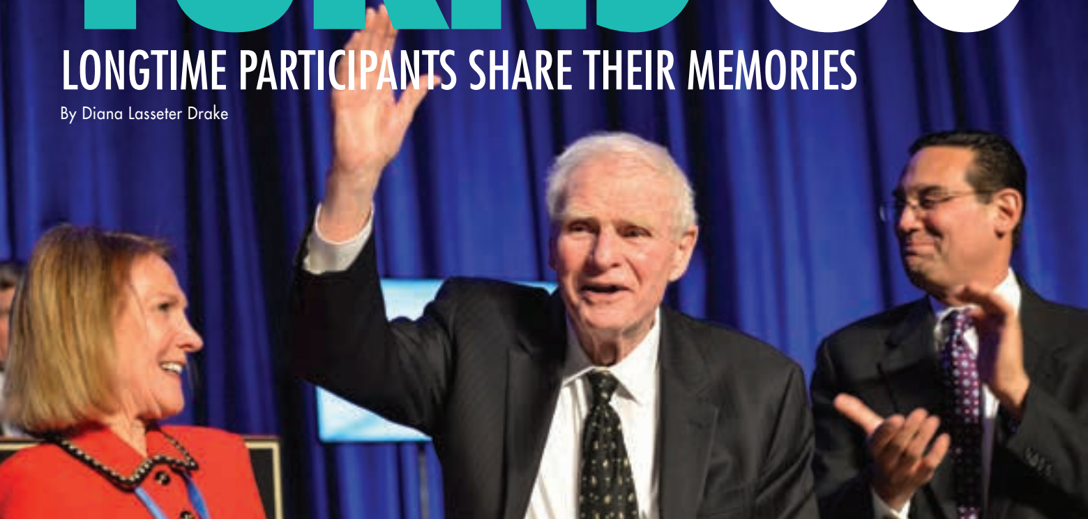
Gov. Brendan Byrne has attended the Walk to Washington 50 times. During the Walk of 1959, “Gov. Meynor told me he was going to make me the prosecutor of Essex County,” he said.

Simply put, New Jersey’s best business networking event of the year is the annual Walk to Washington and Congressional Dinner. What makes it great for participants is the powerful memories the trip leaves – and of course the contacts they gain. So as the 80th annual walk approaches, on Feb. 16 and 17, we asked some veterans of the event to share their Walk to Washington memories.