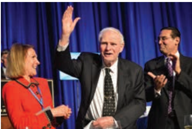
► Gov. Brendan Byrne New Jersey Governor from 1974 to 1982 50-time attendee

"Once in Washington we had a President Bush impersonator. I remember that one of the members of Congress did not realize until after the presentation that it was not actually President Bush. The event is valuable for us because we get the unfiltered perspectives of our customers and our prominent policy makers, be they NGOs, government reps or other influencers, all in one place. It is so important sometimes to speak to the people who are being quoted in New Jersey's media outlets. My only hope is that the people at the end of the train are not the same year after year, because I never make it that far."